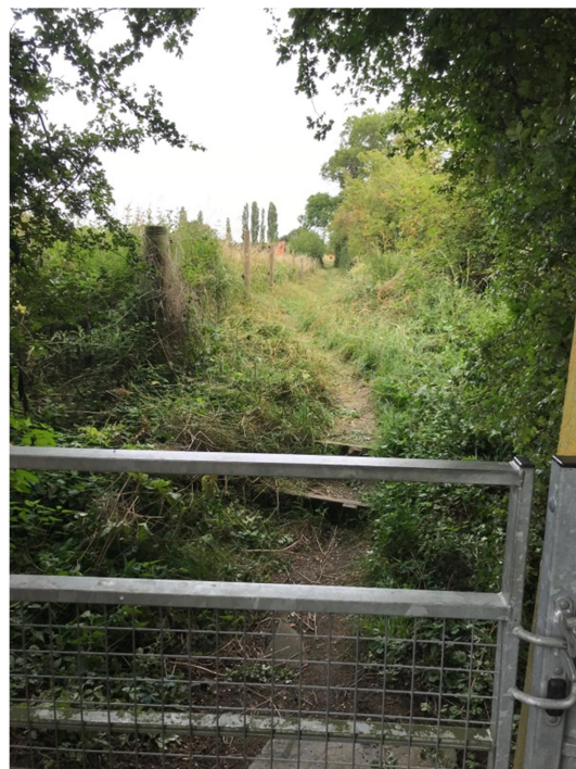
Lovely cleared path for all walkers to enjoy!

Thank you again to the volunteers that came along today – Well done all.