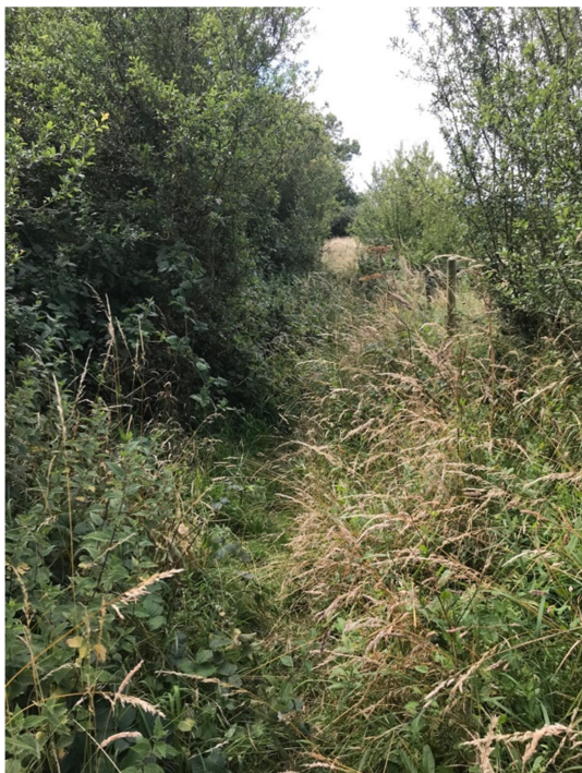
Halfway up the footpath