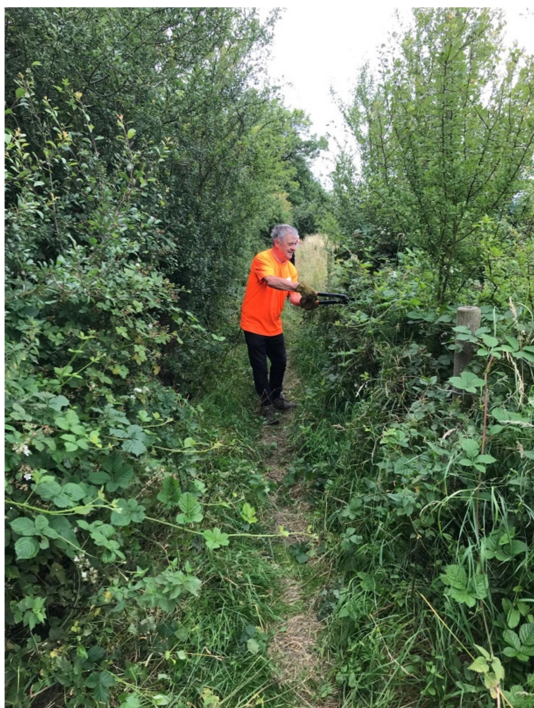
No-one for Andy to talk to today!

On the way back we were able to clear the stiles of the encroaching nettles and bramble.