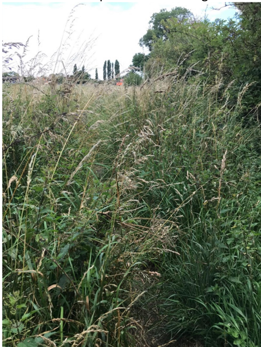
A bit difficult to see a path!

It was a bit warm and humid today so good to be out in the countryside with lots of fresh air. We were also able to have our first task with 2 groups working together. New tools to use and lots of touch points on route with all the stiles to go through, so a safety brief to start to remind us all about social distancing and wearing gloves. Then a good 10-15 minute walk to the start of the overgrown section on the footpath towards Seagrave.